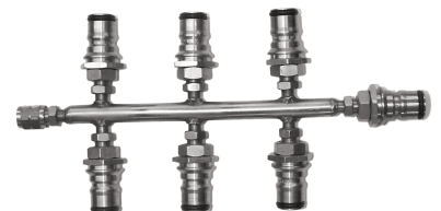
All S/S Sanitary Manifold $105.00

#SANMAN-6 Soda cleaning or gas manifold. Aluminum block with S/S posts. Specify if male ball lock posts are gas or liquid. $85.00